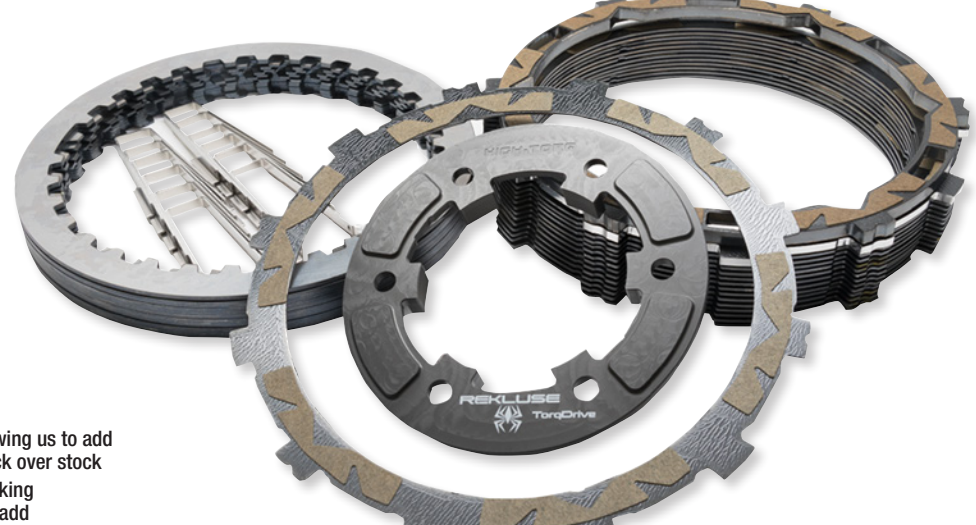
DESCRIPTION For 21-23 RA1250/1250S PanAmerica