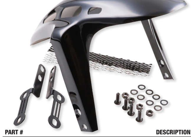
DESCRIPTION For 18-22 Softail models