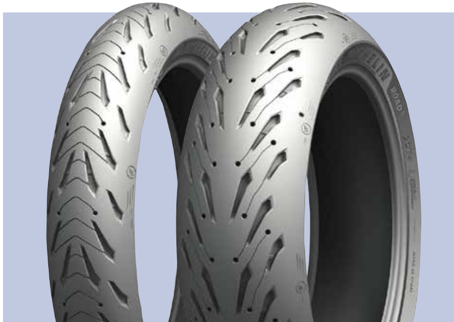
Road 5 Trail Front/Rear