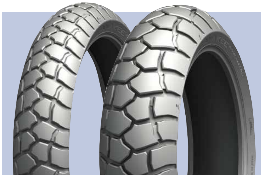
Anakee Adventure Front/Rear