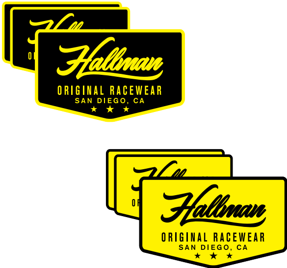
6 PACK (3 BLACK/3 YELLOW) 4320-2046