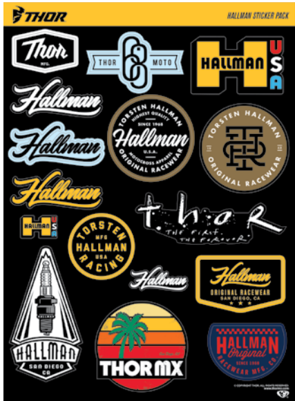
STICKER SHEET 4320-2182