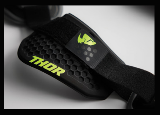
(S) Adjustable shoulder straps and adjustable/removable shoulder pads allow rider custom fit and feel.