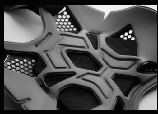
3 Press-Fit molded and ventilated comfort liner system.