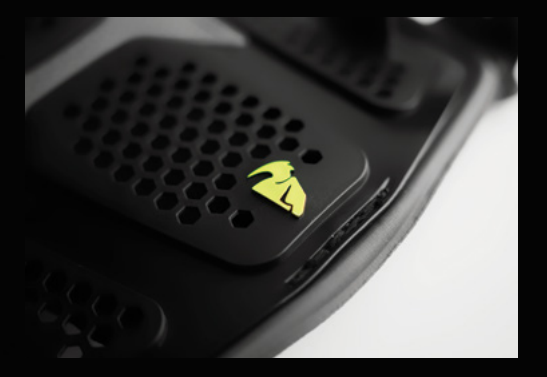
8 Back protector tested and certified according to European Standard EN 1621-2:2014. Level 1.