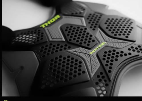
2 Lightweight low-profile front and back panel design.