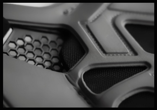
1 Impact foam positioned at chest and back.