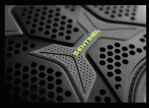
Chest protector tested and certified according to European Standard EN 1621-3:2018. Level 1.