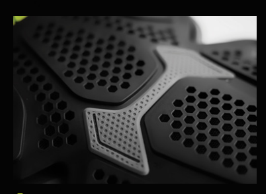
Abundantly placed ventilation ports for maximum cooling.