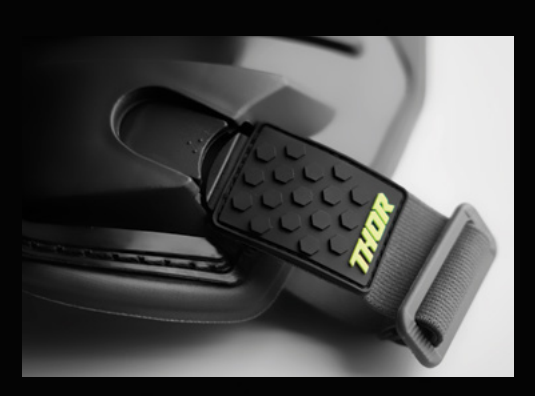
5 Adjustable elastic closure with ratcheting buckle.