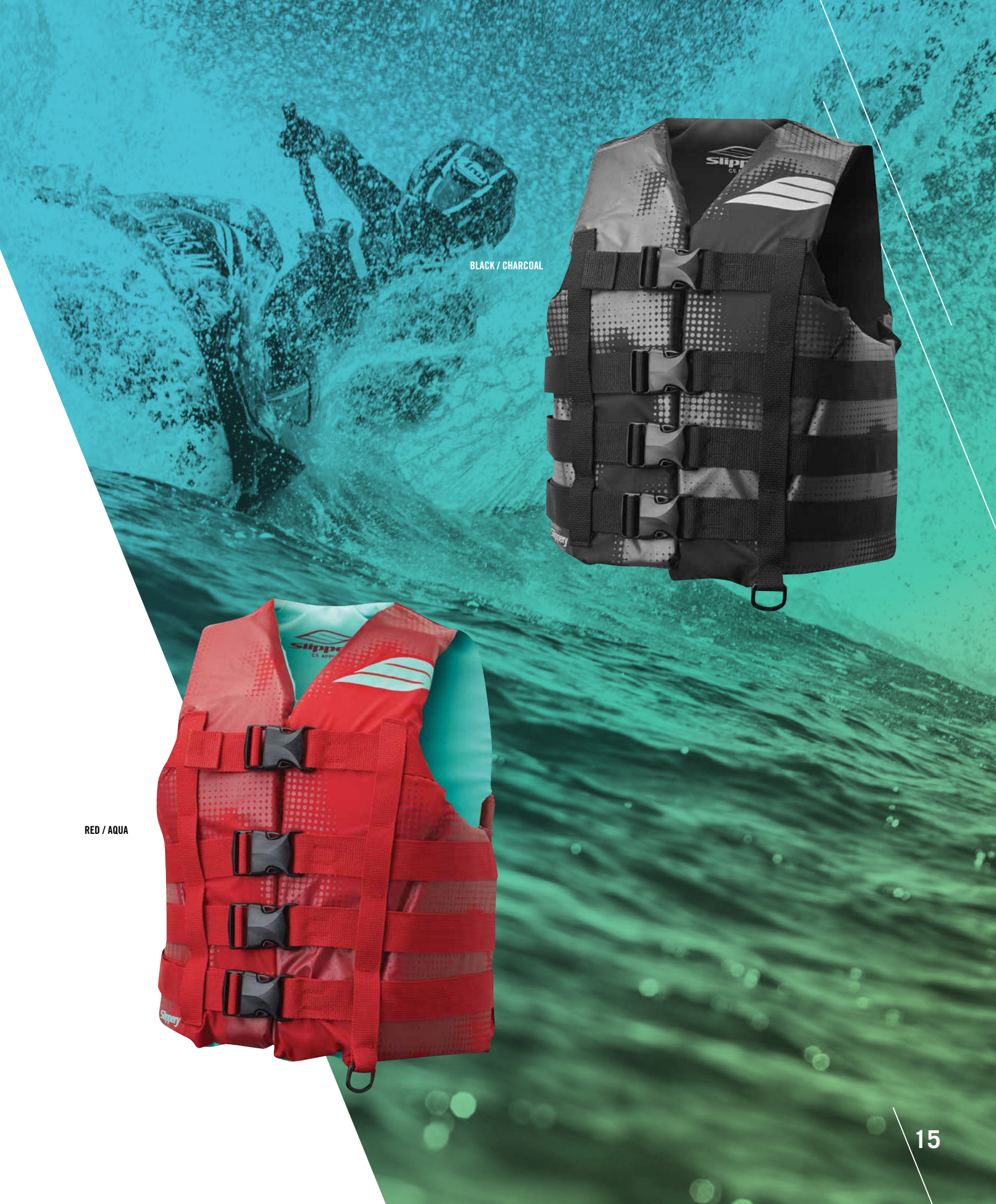
BLACK / CHARCOAL