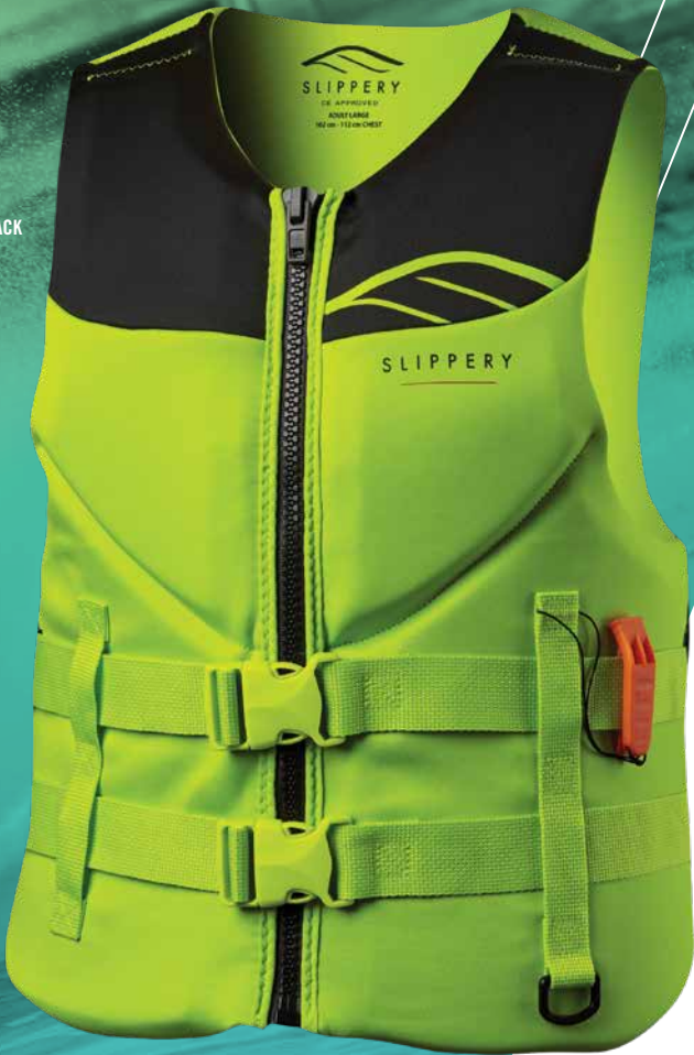
LIME / BLACK