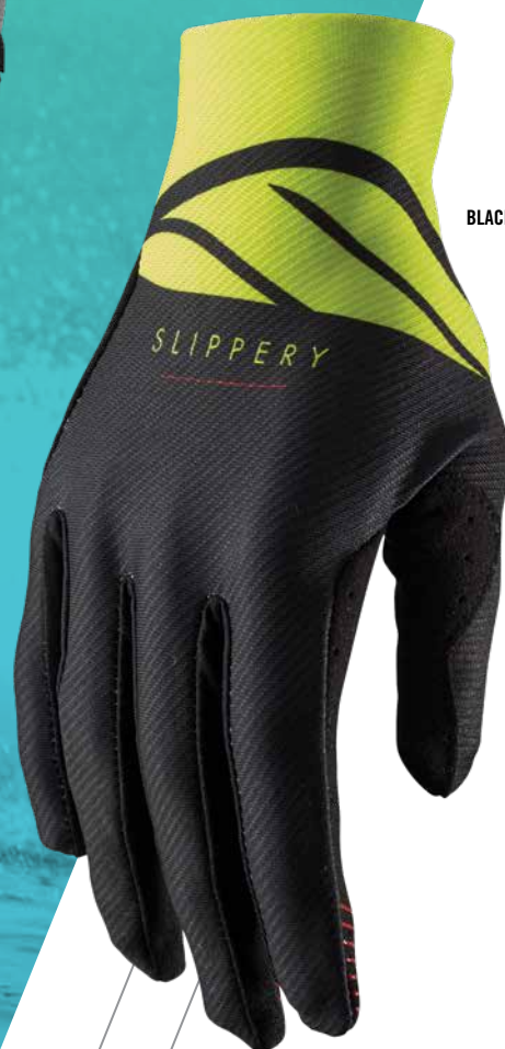
BLACK / LIME