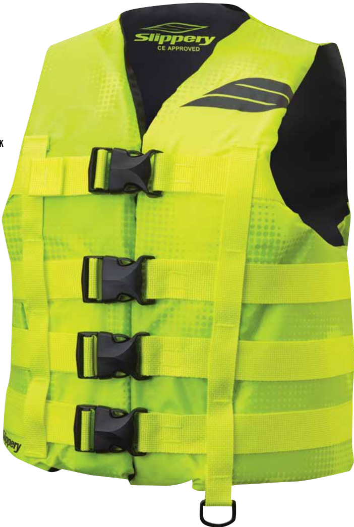
YELLOW / BLACK