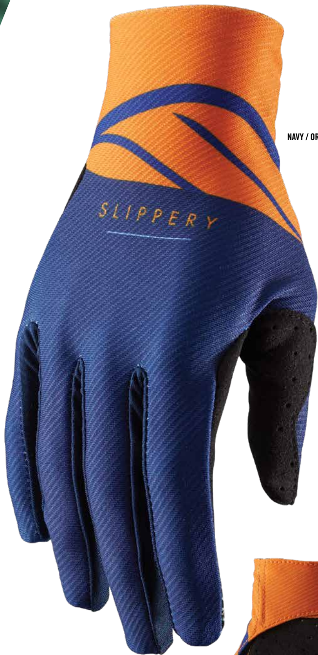
NAVY / ORANGE