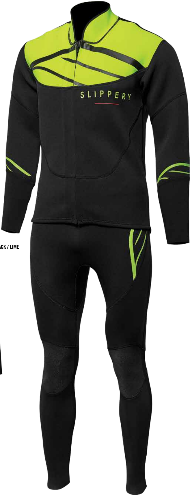
BLACK / LIME