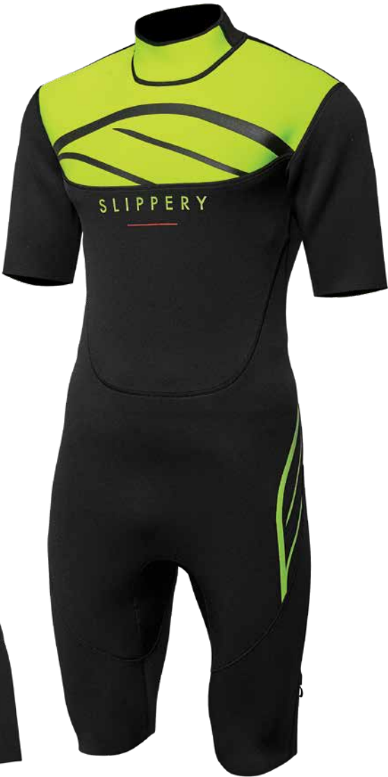
BLACK / LIME