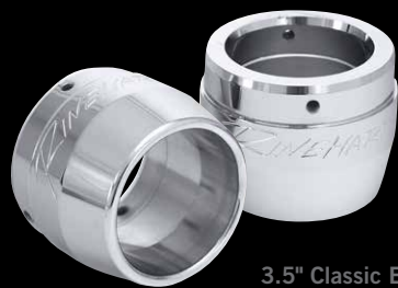
3.5" Classic End Cap