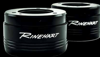
MotoPro 45 Tradition End Cap