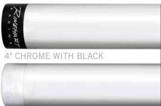
4" CHROME WITH BLACK

2-into-1 muffler can be accessorized with 4" Moto Series™ end caps (see next page)