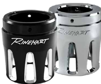
Moto Series™ Merge End Cap