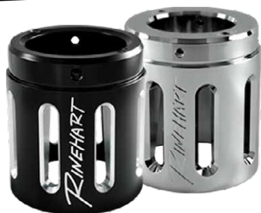
Moto Series™ Slot End Cap