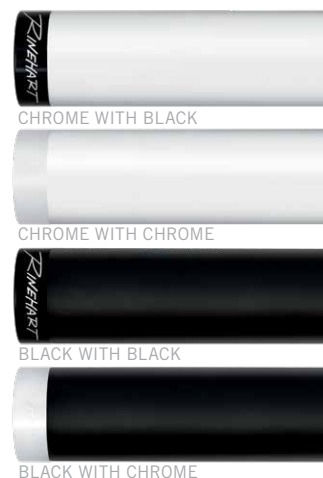
CHROME WITH BLACK