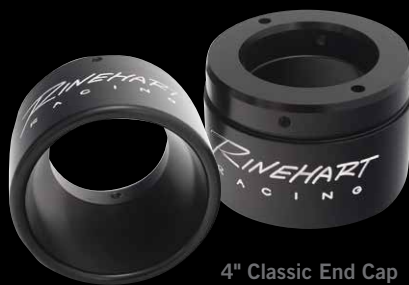
4" Classic End Cap