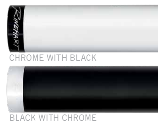
CHROME WITH BLACK