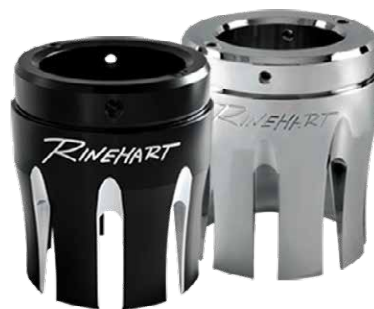
Moto Series™ Castle End Cap