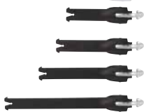
BUCKLE STRAP TECH 8 BLACK 3430-0655