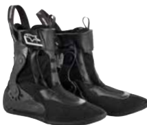
NEW TECH10 3430-0915 7 3430-0916 8 3430-0917 9 3430-0918 10 3430-0919 11 3430-0920 12 3430-0921 13 3430-0922 14