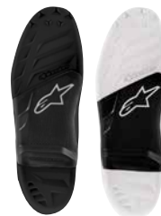
TECH 7 BLACK BLACK WHITE 3430-0516 3430-0528 5 3430-0517 3430-0529 6 3430-0518 3430-0530 7 3430-0519 3430-0531 8 3430-0520 3430-0532 9 3430-0521 3430-0533 10 3430-0522 3430-0534 11 3430-0523 3430-0535 12 3430-0524 3430-0536 13 3430-0525 3430-0537 14 3430-0526 3430-0538 15 3430-0527 3430-0539 16