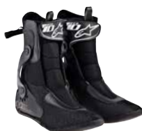
TECH10 3430-0539 7 3430-0540 8 3430-0541 9 3430-0542 10 3430-0543 11 3430-0544 12 3430-0545 13