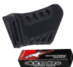
SOLE INSERT NEW TECH10 3430-0923 SZ 7/8 3430-0924 SZ 9/10 3430-0925 SZ 11/12 3430-0926 SZ 13/14