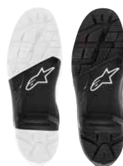
TECH7 ENDURO / TECH3 ENDURO SOLE BLACK WHITE BLACK 3430-0758 3430-0785 7 3430-0759 3430-0786 8 3430-0760 3430-0787 9 3430-0761 3430-0788 10 3430-0762 3430-0789 11 3430-0763 3430-0790 12 3430-0764 3430-0791 13 3430-0765 3430-0792 14