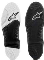
NEW TECH10 BLACK BLACK WHITE 3430-0931 3430-0927 7/8 3430-0932 3430-0928 9/10 3430-0933 3430-0929 11/12 3430-0934 3430-0930 13/14