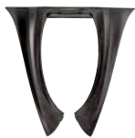
2707-0119 ATTACHMENT PLATE FOR BNS TECH 2