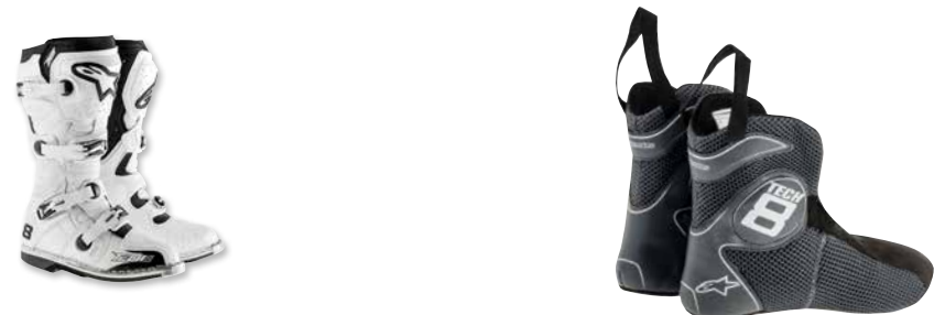
TECH 8 RS INNER BOOTIE