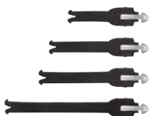
BUCKLE STRAP TECH7 / TECH3 ENDURO / TECH5 / STELLA TECH3 BLACK 3430-0513