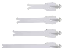
BUCKLE STRAP TECH7 / TECH3 ENDURO / TECH5 / STELLA TECH3 BLACK 3430-0514