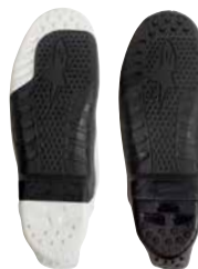
TECH10 BLACK BLACK WHITE 3430-0063 3430-0280 7/8 3430-0064 3430-0281 9/10 3430-0065 3430-0282 11/12 3430-0066 3430-0283 13/14