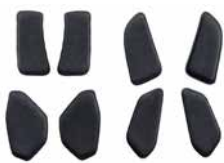
2707-0120 CHIN PLATE FOR BNS TECH 2