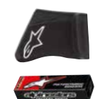
NEW SOLE INSERT TECH7 / TECH7 ENDURO / TECH3 ENDURO 3430-0554 SZ 5 3430-0561 SZ 12 3430-0556 SZ 7 3430-0562 SZ 13 3430-0557 SZ 8 3430-0563 SZ 14 3430-0558 SZ 9 3430-0565 SZ 16 3430-0559 SZ 10 3430-0560 SZ 11